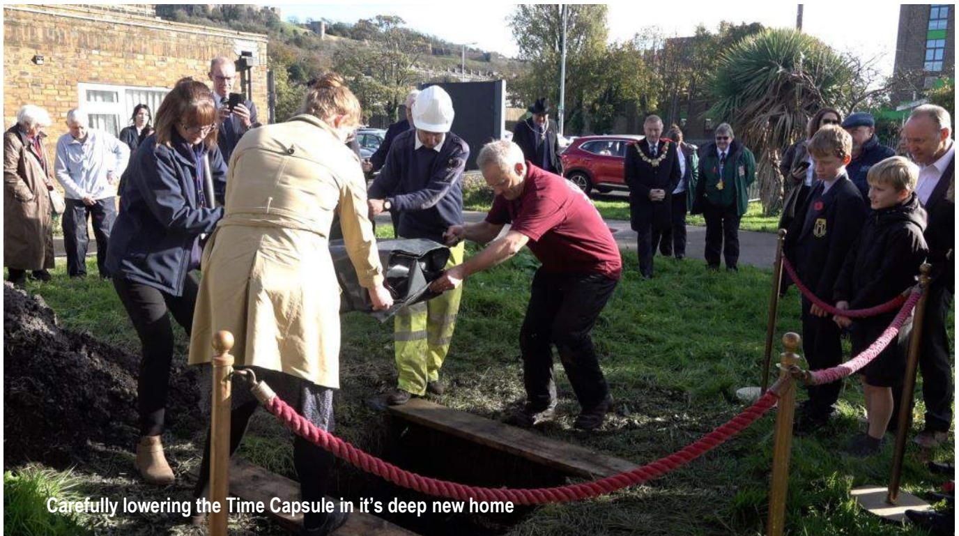
Carefully lowering the Time Capsule in it's deep new home