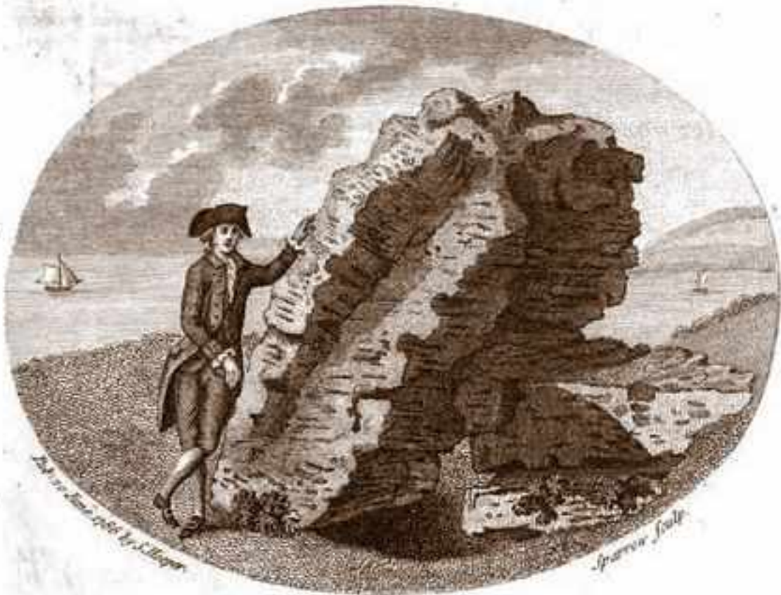
Bredenstone, or the Devils Drop.

. UNESCO World Heritage Sites. United Nations Educational, Scientific and Cultural Organisation set up the World Heritage List in 1975 following the World Heritage Convention in 1972 where 20 Nations agreed to set up a Fund to help preserve places of Natural and Cultural Heritage importance. By the time the first site was established - that being the Galapagos Islands in Ecuador. 40 Nations had signed up to the Convention and there are now 195 nations signed up, and over a 1000 sites listed of World Heritage Status.. The UK has 33 sites listed, including Canterbury Cathedral, St Augustine's Abbey and St Martins Church; Durham Castle and Cathedral; Forth Bridge; Giant's Causeway; Stonehenge: Tower of London; Liverpool - Maritime Mercantile City was removed due to irreversible loss of attributes following recent building developments were considered to ruin Liverpool's authenticity and integrity. Stonehenge may lose it's status as there are plans to build a road tunnel which will cause it to be listed as "in Danger".